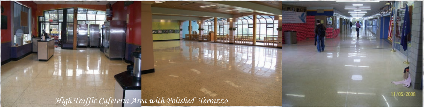
High Traffic Cafeteria Area with Polished Terrazzo